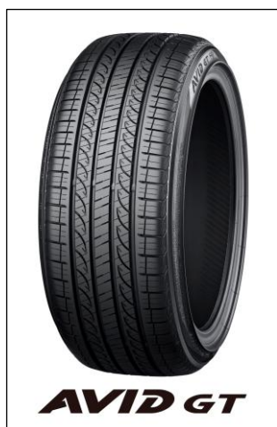
* The tire shown in photo differs in size from those installed on the Nissan LEAF

In addition to strengthening its marketing of tires to be used as OE on EVs, which require tires made using the most advanced technologies, Yokohama Rubber is utilizing the feedback received from EV makers in its development of replacement tires as it seeks to expand its product lineup and improve the performance of all its tires to meet new requirements in this era of dynamic change.