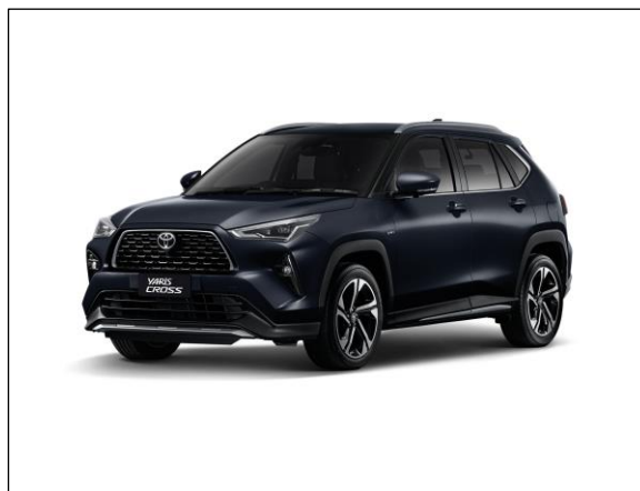
New YARIS CROSS

*Tire shown in photo differs in size from those installed on the YARIS CROSS