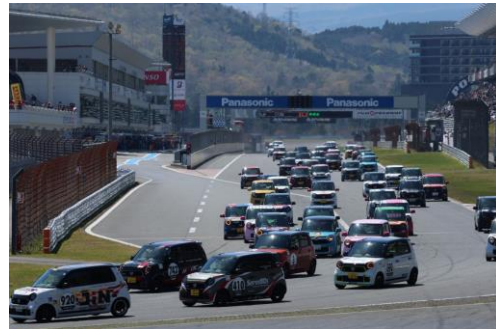
N-ONE OWNER'S CUP (2023)