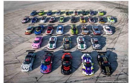
911 GT3 Cup (Type 992) race cars participating in the Porsche Carrera Cup North America

Starting this year, Yokohama Rubber will be supplying ADVAN racing tires as the control tire for the Porsche Carrera Cup North America, the top tier Porsche one-make racing series in North America and part of the global Porsche Carrera Cup series. Yokohama Rubber will supply ADVAN A005 tires for dry conditions and ADVAN A006 tires for wet conditions. Porsche Carrera Cup North America races feature professional and amateur drivers competing in Porsche 911 GT3 Cup (Type 992) race cars with specs based on Porsche's 911 Carrera (Type 992). Yokohama Rubber will also supply control tires for the Porsche Sprint Challenge North America by Yokohama and Porsche Sprint Challenge USA West by Yokohama. These two series are step-up category races for semi-pro drivers aiming to compete in the Porsche Carrera Cup.