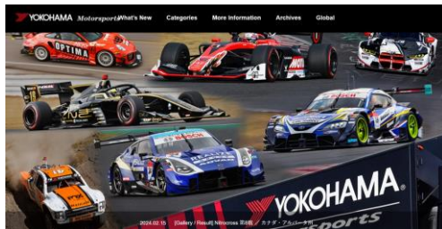
YOKOHAMA Motorsports website top page

https://www.y-yokohama.com/cp/global/motorsports/