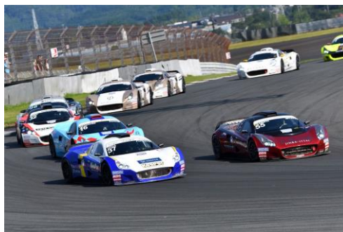
Inter Proto Series (2023)

Yokohama Rubber will again supply its ADVAN racing tires to a number of other GT and touring car races held around the world, including the Toyota Gazoo Racing Motorsport races and Honda One Make Races in Thailand and the Inter Proto Series in Japan.