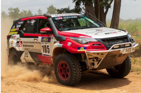
AXCR 2023 overall champion GEOLANDAR equipped Toyota Fortuner

Yokohama Rubber will again supply its GEOLANDAR M/T G003 to teams participating in this year's Asia Cross Country Rally, the largest cross country rally in Asia. GEOLANDAR equipped vehicles dominated at AXCR 2023, finishing first, second, and third, and capturing a second-straight overall championship. We are aiming for a third-straight overall championship at AXCR 2024.