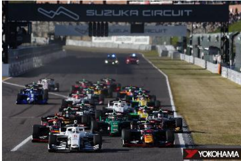
Cars racing in a 2023 Japanese SUPER FORMULA Championship race

YOKOHAMA tires have been the control tires for the Japanese SUPER FORMULA Championship series since 2016. Last year, Yokohama Rubber began supplying ADVAN A005 racing tires for use in dry conditions that have a 33% sustainable material content ratio as the series' control tire. This season, we are increasing the use of sustainable materials by supplying a new version of our ADVAN A006 tire for wet conditions that has a higher sustainable material content ratio. This activity is part of an effort to create a sustainable motorsports industry, and Yokohama Rubber is continuing to advance its development of racing tires that sustainable materials without compromising driving performance as part of a broader perspective to develop tires suitable for a circular economy.