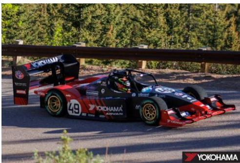
ADVAN equipped vehicle that won the overall championship at the 2023 Pikes Peak International Hill Climb

Yokohama Rubber will again participate in the Pikes Peak International Hill Climb in the United States. In 2023, a car equipped with ADVAN racing tires won the overall championship for the second straight year, while other ADVAN equipped cars finished first in five classes. We will again supply ADVAN racing tires to drivers competing in many classes and hope to achieve a third consecutive overall championship. In addition, we will again provide the control tire for the Porsche Pikes Peak Trophy by Yokohama, a hill climb competition for Porsche Cayman GT4 Clubsport vehicles.