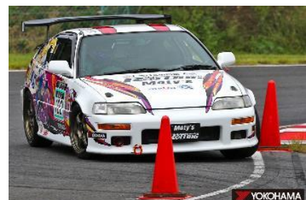
Car competing in a 2023 All Japan Gymkhana Championship

Last year, cars equipped with YOKOHAMA's ADVAN NEOVA AD09 and ADVAN A050 high-performance tires captured the series championship in two classes. This year, YOKOHAMA tires will again support the aggressive driving of drivers aiming to capture the series championship in many classes.