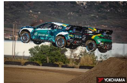
Car in flight at a 2023 Nitrocross race

Yokohama Rubber will again supply the control tire for Nitrocross, a highly popular rallycross racing series in North America that began in 2021. The control tire for EV category cars as well as internal combustion engine cars will be the ADVAN A054 rallycross tire, which was developed specifically for rallycross.