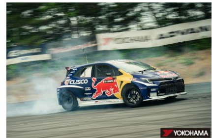
ADVAN NEOVA AD09 equipped car driven by FIA World Rally Championship (WRC) champion Kalle Rovanperä on its way to victory in 2023 FDJ 2 nd round

Following last year's success, Yokohama Rubber will again supply its ADVAN NEOVA AD09 to several teams participating in this year FDJ. We will also supply ADVAN NEOVA AD09 tires and ADVAN APEX V601 tires as the control tires for, respectively, FDJ2 and FDJ3 races.