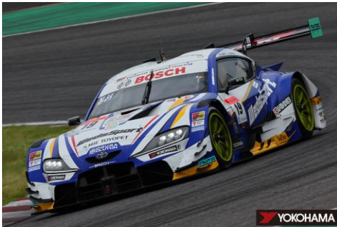
〈SUPER GT GT500 class〉 TGR TEAM WedsSport BANDO WedsSport ADVAN GR Supra (2023)

Super GT races are contested in two classes, GT500 and GT300. GT500 is dominated by works teams from major automakers while GT300 teams tend to be more varied and individualistic. While all GT500 machines must meet certain specifications, GT300 races are open to a variety of cars made in Japan and overseas. GT300 machines can broadly be divided into three types: (1) automakers' production cars that meet the international FIA GT3 specifications, (2) Japan's unique GTA-GT300 machines, and (3) the so-called "Mother Chassis" group of machines. In 2023, a YOKOHAMA-supported team was victorious in the GT500 class SUPER GT third round race, and YOKOHAMA-supported teams dominated the GT300 class, finishing first in four of the series' eight races. This year, we look forward to more victories, with ADVAN racing tires being supplied to two cars in the GT500 class and 15 cars in the GT300 class.