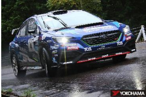
SUBARU WRX S4 (2023)

Last year, Yokohama Rubber provided teams competing in the Japanese Rally Championship with ADVAN A051T, ADVAN A08B and ADVAN A052 tires for use on tarmac and the ADVAN A053 for use on gravel. These high-performance tires contributed to overall championships in three of six classes. We again will be aiming for championships in multiple classes, including the series highest JN1 class.