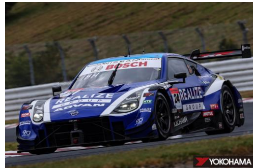
〈SUPER GT GT500 class〉 KONDO RACING REALIZE CORPORATION ADVAN Z (2023)