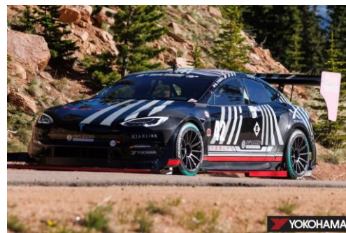
Car competing in the 2023 Pikes Peak International Hill Climb on ADVAN A005 tires using biomass materials