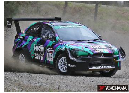
Car competing in a 2023 All Japan Dirt Trial Championship race

Last year, Yokohama Rubber supplied teams competing in several classes with a lineup of tires that deliver superior performance on various surfaces, starting with ADVAN A053 tires and including ADVAN A031 tires for softer surfaces and ADVAN A036 tires for ultra-hard surfaces. Teams using YOKOHAMA tires captured series championships in six classes. This year, YOKOHAMA high-performance tires will again support the aggressive driving of drivers aiming to capture the series championship in many classes.