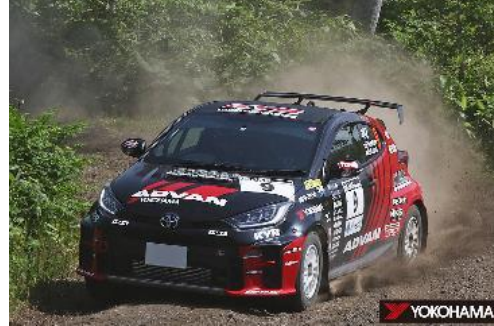
ADVAN KYB KTMS GR YARIS (2023)