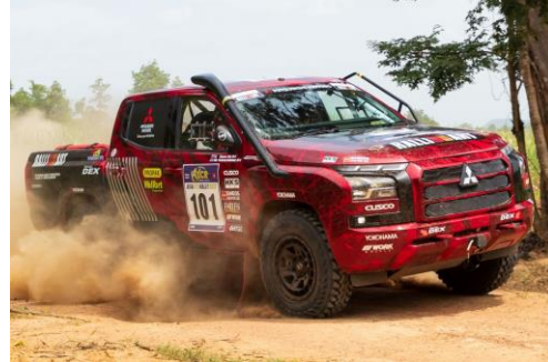
AXCR 2023 third place finisher GEOLANDAR equipped Mitsubishi Triton