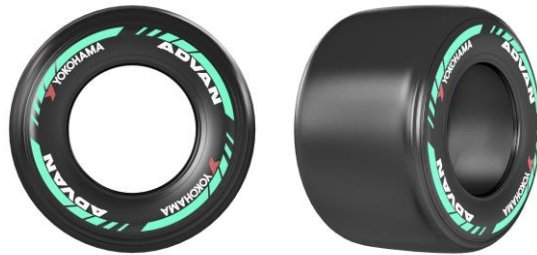
ADVAN racing tires made from sustainable materials