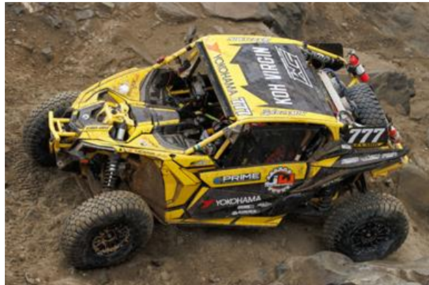
GEOLANDAR SD equipped vehicle driven by Zach Szymik