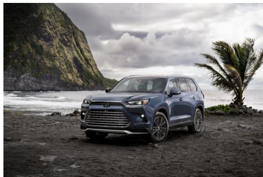
The first-ever Toyota Grand Highlander