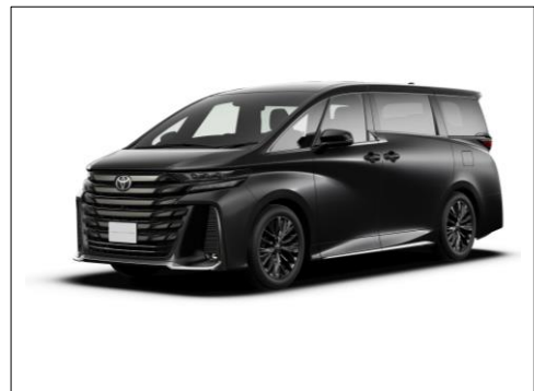
The new Vellfire

*The above photos are used with the permission of Toyota Motor Corporation. Reprint or other usage of these images without prior permission from Toyota Motor Corporation is strictly prohibited.