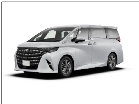
The new Alphard