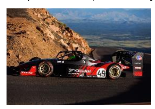
ADVAN-equipped vehicle, which won the overall championship at Pikes Peak International Hill Climb (2022)

This year, Yokohama Rubber will again participate in the Pikes Peak International Hill Climb in Colorado, USA, where an ADVAN racing tire-equipped vehicle won the overall championship last year. This year, we will be providing EV vehicles participating in the exhibition class with ADVAN tires made from biomass-derived butadiene rubber again, while supplying our tires to many teams participating in other classes, in order to win consecutive championships. In addition, we will continue our role as provider of the control tire for the Porsche Pikes Peak Trophy by Yokohama, a hill climb that pits drivers of Porsche Cayman GT4 Clubsport vehicles against each other.