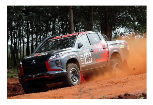
GEOLANDAR-equipped vehicle, which won the overall championship in the Asia Cross Country Rally 2022

We will supply GEOLANDAR M/T G003 to the teams participating in the Asia Cross Country Rally 2023, the largest cross country rally in Asia. Last year, the vehicles equipped with these tires won the overall championship and also demonstrated excellent performance by taking the third, fourth and fifth places of five overall prizes.