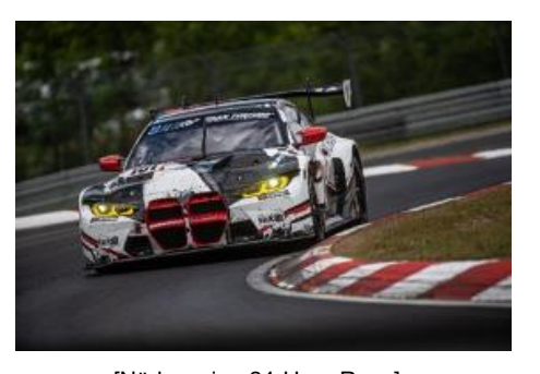
[Nürburgring 24-Hour Race] Walkenhorst Motorsport BMW M4 GT3 (2022)

Yokohama Rubber will be participating in the Nürburgring 24-Hour Race (ADAC TotalEnergies 24h Nürburgring) and Nürburgring Endurance Series (NLS) by supplying ADVAN racing tires to the three BMW M4 GT3 cars being entered by BMW's Customer Racing team Walkenhorst Motorsport, continuing the partnership agreement that began in 2021. This year, we will aim to win the overall championship in the 24-hour race with two SP9 Pro class cars.