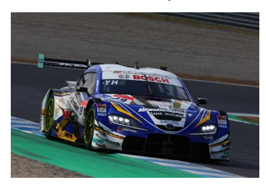
[SUPER GT GT500 Class] TGR TEAM WedsSport BANDOH WedsSport ADVAN GR Supra (2022)

Super GT races are contested in two classes, GT500 and GT300. GT500 is dominated by works teams from major automakers while GT300 teams tend to be more varied and individualistic. While all GT500 machines must meet certain specifications, GT300 races are open to a variety of cars made in Japan and overseas. The GT300 machines can broadly be divided into three types: (1) automakers' production cars that meet the international FIA GT3 specifications, (2) unique GTA-GT300 machines, and (3) the so- called "Mother Chassis" group of machines. Last year, KONDO RACING's REALIZE NISSAN MECHANIC CHALLENGE GT-R won the series championship in the GT300 class. In GT500, YOKOHAMA-supported teams won five pole positions in eight races. This year, we will supply ADVAN racing tires for two vehicles of GT500 and 16 vehicles of GT300, and aim to win GT500 and the series champion in GT300 consecutively.