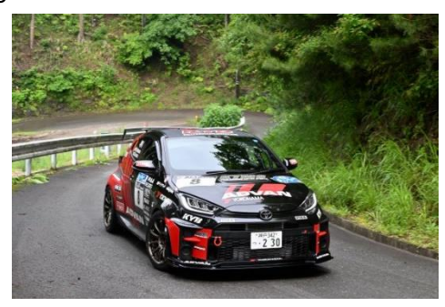
Fumio Nutahara/Shungo Azuma ADVAN KYB KTMS GR YARIS (2022)