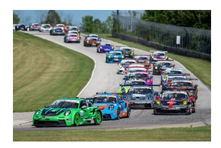
[Porsche Sprint Challenge North America by Yokohama] Porsche 911 GT3 Cup (2022)