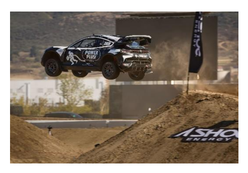
[Nitro Rallycross] Participating vehicle (2022)

We also will be supplying ADVAN rallycross tires to teams participating in the Nitro Rallycross (NRX), which was launched in 2021 in North America and is expanding into the Middle East this year. Yokohama Rubber will provide its ADVAN rallycross tires as control tires for the vehicles in EV category in addition to internal combustion engine vehicles.