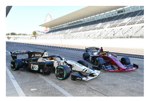
New model SF23

YOKOHAMA tires have been the control tires for the Japanese SUPER FORMULA Championship since 2016. This year, we will begin supplying ADVAN racing tires, made from 33% sustainable materials, as control tires. Racing tires using sustainable materials are being supplied in support of SUPER FORMULA NEXT 50 project promoted by Japan Racing Promotion Inc., which runs the SUPER FORMULA series. This project is being promoted with the cooperation of various companies that share the common goal of creating a sustainable motorsports industry by responding to changes in the environment surrounding the automobile and motorsports industries, including the promotion of SDGs and carbon neutrality. From the perspective of promoting the development of circular economy tires, Yokohama Rubber aims to develop racing tires that include sustainable materials without compromising driving performance. Yokohama Rubber tested its tires as part of the trial runs for next-generation formula cars that were held before and after each SUPER FORMULA race during the 2022 season. The company will continue its efforts to develop tires with higher sustainable material content in 2023 and coming years.