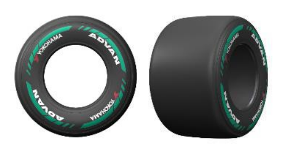
ADVAN racing tires made from sustainable materials