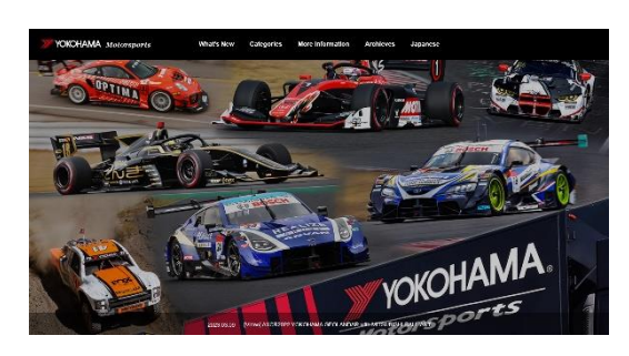
Top page of the YOKOHAMA Motorsports website

https://www.y-yokohama.com/cp/global/motorsports/