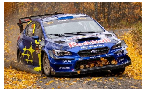
[ARA Rally] Subaru Rally Team USA (2022)

We will supply ADVAN rally tires to the Subaru Rally Team USA, which participates in the ARA (American Rally Association) Rally in the United States, and the Toyota Team Thailand, which participates in the FIA Asia-Pacific Rally Championship 2023 Round 2 "South India Rally".