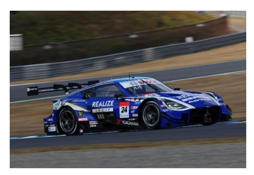
[SUPER GT GT500 Class] KONDO RACING REALIZE CORPORATION ADVAN Z (2022)