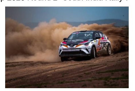
[FIA Asia-Pacific Rally Championship 2023 Round 2 "South India Rally"] Toyota Team Thailand (2022)