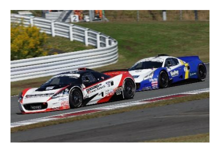
[Inter Proto Series] (2022)