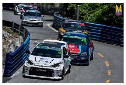
[RAAT Thailand Endurance International Championship] (2022)