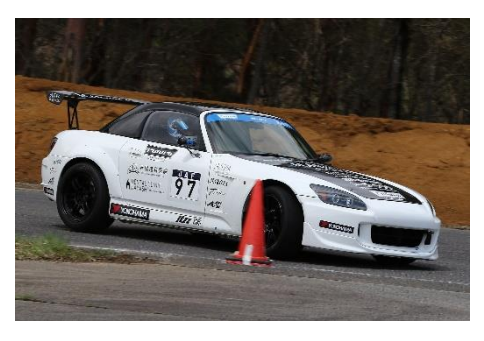
[2022 Japanese Gymkhana Championship] Maroya Trailer S2000 Asya

Gymkhana are time-based competitions in which cars run oneby-one over a paved course with obstacles. In 2023, we will be supplying our ADVAN NEOVA AD09, and ADVAN A050 highperformance tires to teams aiming to capture series championships in several Gymkhana classes.