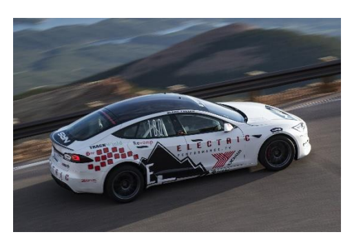
ADVAN A052-equipped vehicle, which is made from biomass materials, at Pikes Peak International Hill Climb (2022)