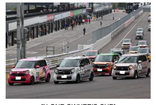
[N-ONE OWNER'S CUP] (2022)