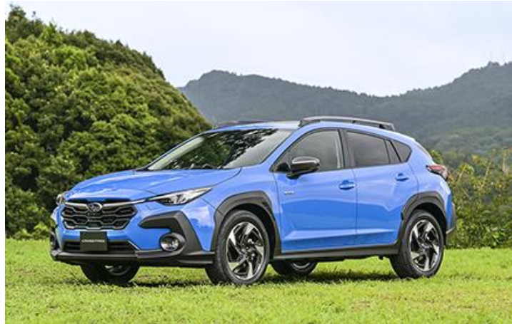
The new Crosstrek

*Tire shown in photo differs in size from those installed on the Crosstrek.