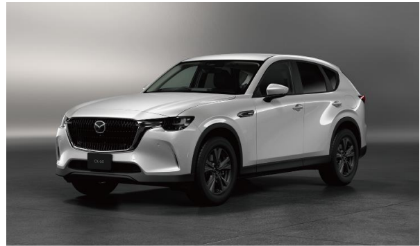
New MAZDA CX-60

*The GEOLANDAR X-CV tire shown in photo differs in size from those installed on the new MAZDA CX-60