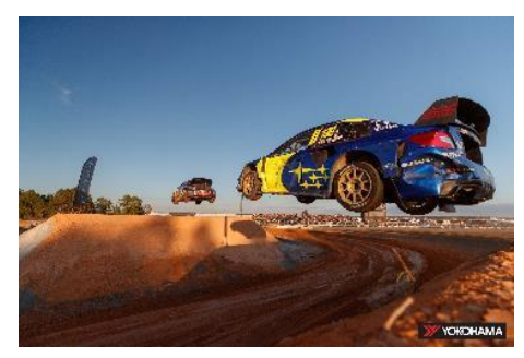
A typical NRX (Nitro Rallycross) scene