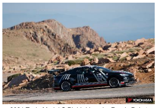
2021 Tesla Model S Plaid driven by Randy Pobst climbing to a first-place finish in the Exhibition class