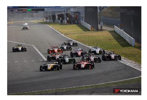
Japanese SUPER FORMULA LIGHTS in 2021 Championship

The driver who wins the SUPER FORMULA LIGHTS series championship will qualify to participate in the season-ending SUPER FORMULA rookie test. Accordingly, the SUPER FORMULA LIGHTS series has become known as the "Gateway to becoming a top driver," and we are proud to once again support drivers' efforts by supplying ADVAN A005 tires for use on dry tracks and the ADVAN A006 for races on wet tracks.