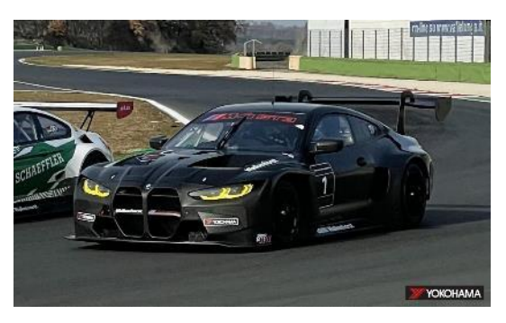
A Walkenhorst Motorsport BMW M4 GT3 on a test run