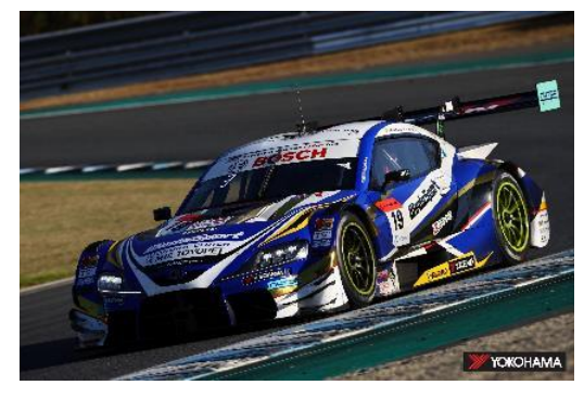
TGR TEAM WedsSport BANDOH's WedsSport ADVAN GR Supra is competing in the GT500 class

Super GT races are contested in two classes, GT500 and GT300. GT500 is dominated by works teams from major automakers while GT300 teams tend to be more varied and individualistic. While all GT500 machines must meet certain specifications, GT300 races are open to a variety of cars made in Japan and overseas. The GT300 machines can broadly be divided into three types: (1) automakers' production cars that meet the international FIA GT3 specifications, (2) unique JAF-GT machines, and (3) the so-called "Mother Chassis" group of machines. YOKOHAMA-supported teams participated in all eight GT500 races in 2021, reaching the podium on three occasions. In 2022, we will be supporting two teams in their efforts to win the GT500 class championship. In the GT300 class, we are supporting 15 teams and look forward to reclaiming the series championship won in 2020.