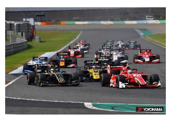
Japanese SUPER FORMULA in 2021 Championship

YOKOHAMA tires have been the control tires for the Japanese SUPER FORMULA Championship since 2016. In 2022, we will again supply ADVAN A005 tires for use on dry tracks and ADVAN A006 tires for use on wet tracks. From 2023, we plan to provide the SUPER FORMULA series with racing tires made from sustainable materials, including a naturally derived compounding agent and recyclable raw materials. Toward that end, we will be testing tires now under development in trial runs before and after each of this year's seven SUPER FORMULA series races.