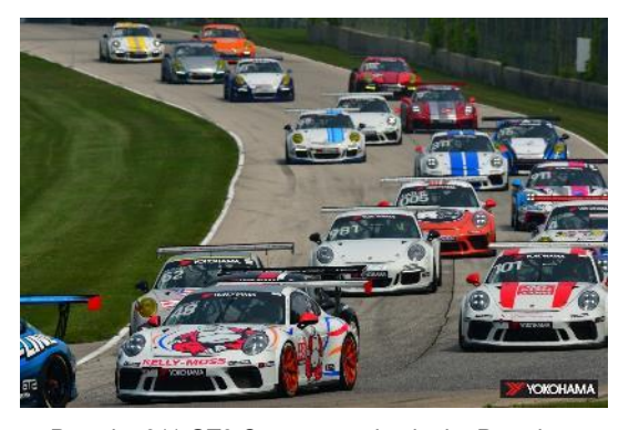
Porsche 911 GT3 Cup cars racing in the Porsche Sprint Challenge North America by Yokohama

In addition to the above races, Yokohama Rubber will continue in its role as supplier of the control tires for the Porsche Sprint Challenge North America by Yokohama and the Yokohama Drivers Cup USA, providing our ADVAN racing tires to race participants for a second straight year. We will also continue to supply our ADVAN racing tires for use in the Inter Proto Series in Japan.