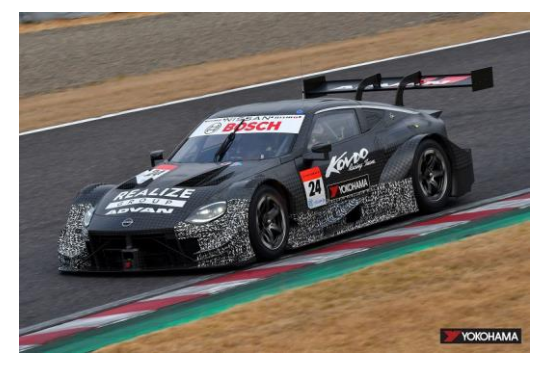
KONDO RACING'S REALIZE CORPORATION ADVAN Z is competing in the GT500 class