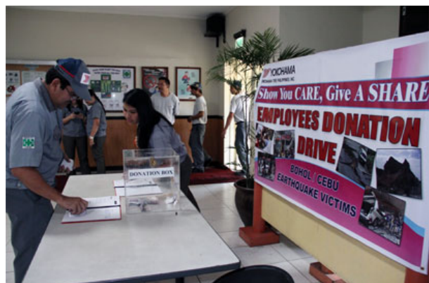
YTPI employees’ donation drive