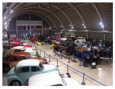
Famous, classic cars on display.

横浜ゴム株式会社 広報部 広報・IRグループ 〒105-8685 東京都港区新橋5丁目36番11号 TEL:(03) 5400-4531 FAX:(03) 5400-4570