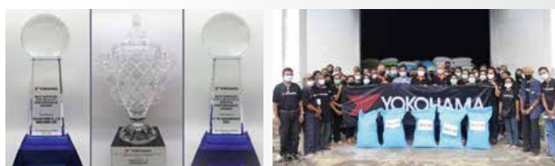
Trophies presented to supplier award winners

rubber for natural rubber farmers in Thailand. The natural rubber farmers that took part have also helped in conducting follow-up surveys on natural rubber properties and productivity.