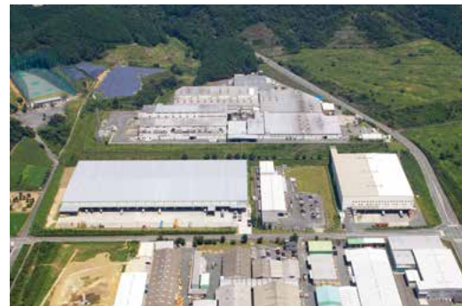
The Shinshiro-Minami Plant serving as a model plant for carbon neutrality

We aim to reduce CO 2 emissions from our own activities by 38% compared with 2013 levels by 2030, and achieve net zero CO 2 emissions by 2050. At our production sites, we will use the Shinshiro-Minami Plant as a model plant for achieving carbon neutrality by 2030, roll out that know-how to other plants in Japan and overseas and strive to achieve carbon neutrality across all plants by 2050. As a company-wide activity beyond manufacturing sites, we will continue to implement 1% annual in-house improvement activities that promote improvements and revisions to facilities, equipment and transportation processes, and aim to achieve carbon neutrality.