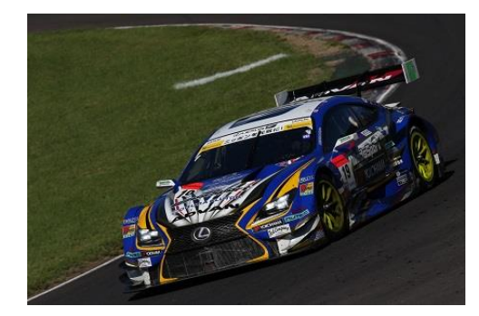
<SUPER GT/GT500> LEXUS TEAM WedsSport BANDOH's LEXUS RC F Placed in each round of the 2015 GT500 series (2015)