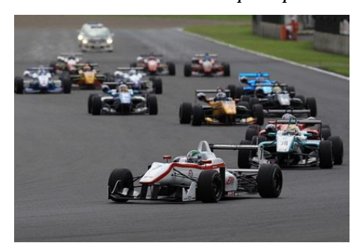
Japanese Formula 3 Championship race (2015)

YOKOHAMA again this year will supply control tires to the Japanese Formula 3 Championship and the Japan's Super