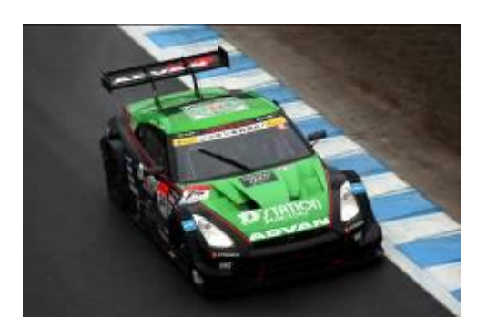
<SUPER GT/GT500> KONDO RACING'S NISSAN GT-R Winner of the fourth round of the 2015 GT500 series (2015)

Super GT races are contested in two classes, GT500 and GT300. GT500 is dominated by works teams from major automakers, while GT300 teams tend to be more varied and individualistic. GT500 cars are touring cars with high aerodynamic performance. Like cars competing in the Japanese SUPER FORMULA Championship Series, GT500 cars are equipped with direct-injection gasoline turbo engine with 2,000cc displacement. GT300 cars are a mix of cars manufactured and sold by automakers that are adjusted to meet international standards for FIA GT3 machines and cars that meet Japan's JAF-GT standards. The implementation of the "mother chassis" rule for GT300 cars in 2015 opened up the GT300 competition to a wider variety of car models made by Japanese and foreign automakers. In 2016, Yokohama Rubber is supporting two GT500 cars: KONDO RACING's NISSAN GT-R and the LEXUS TEAM WedsSport BANDOH's LEXUS RC F. In the GT300 class, we are supplying Yokohama tires to more than 20 cars seeking to capture the title. As in 2015, the Super GT series' eight races, including the one in Thailand, are expected to draw huge crowds of racing fans.