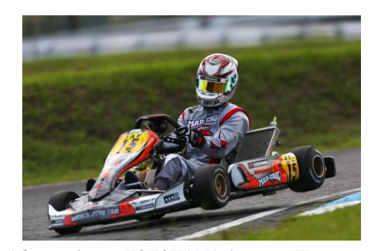
A kart racing on YOKOHAMA tires at a KF category of All Japan Karting Championship race (2015)

YOKOHAMA will again be an avid participant in the KF category of the All Japan Karting Championship, hoping to again propel the winner of the opening race of the series and many others thereafter. In addition, YOKOHAMA tires will again be the control tire for the FP-Junior category of the Japanese Junior Karting Championship. We also will stay active overseas, again supplying the control tire for this year's Asian Karting Open Championship. Yokohama Rubber will also continue supplying its tires to circuit races in the Philippines, Thailand and elsewhere.