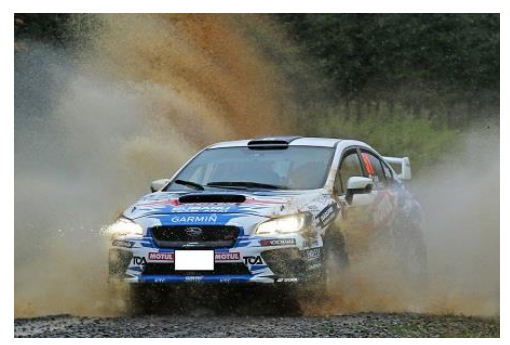
Fuji Subaru Arai Motor Sports WRX 2015 JN6 class championship car (2015)