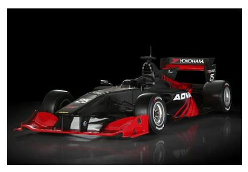
A Japanese SUPER FORMULA Championship Series racing car. The ADVAN color and markings are not used on actual race participants.

From 2016, YOKOHAMA's ADVAN racing tires have been adopted as the control tires for the Japanese SUPER FORMULA Championship Series, Asia's ultimate Formula racing series. The control tires will include the ADVAN A005 and the ADVAN A006 for use on wet surfaces. Both tires make use of YOKOHAMA's proprietary orange oil compounding technique to ensure superior grip performance while enhancing environmental performance. The supplied tire sizes will be 250/620R13 for front tires and 360/620R13 for rear tires. YOKOHAMA has been an avid participant and supporter of top-level Formula racing in Japan, dating back to its first involvement in the All-Japan Formula 2 Championship series in 1980. YOKOHAMA has also participated in the All-Japan F3000 Championship since 1987 and in the initial Formula Nippon series in 1996. The initial Formula Nippon series has used another tire maker's product since 1997 but this year decided to return to YOKOHAMA tires for the first time in 20 vears.