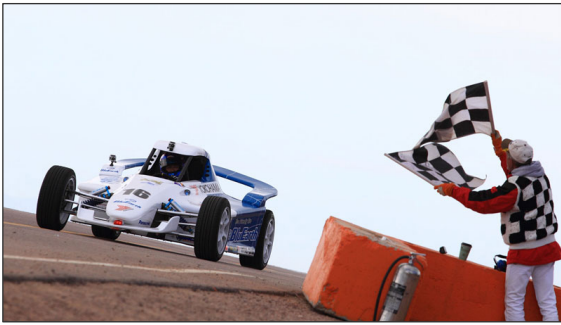
EV on “BluEarth-A” crosses finish line in own best time.