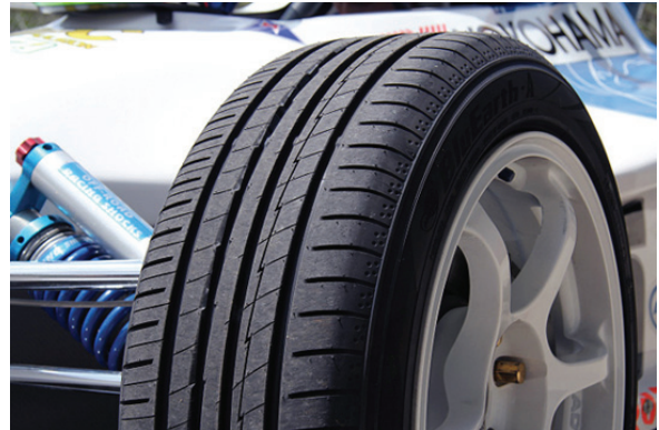
BluEarth-A tires support high-performance driving with improved fuel efficiency.

• Vehicle name: HER-02 • Tires: BluEarth-A • Tire size: 215/50R17 (front)/245/45R17 (rear) • Motor: AC Propulsion AC induction motor • Battery: Panasonic lithium-ion battery • Maximum output: 190kW (258ps/255hp) • Maximum torque: 280Nm (207 lb-ft) • Body size (mm): 3,800 (length) × 1,900 (width) × 1,100 (height) • Drive type: Mid-ship rear-drive