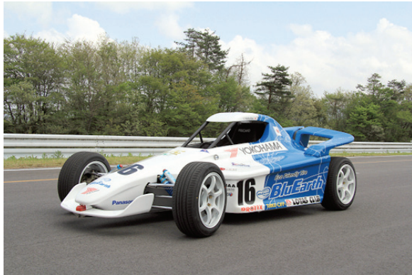
EV racing car painted in BluEarth colors