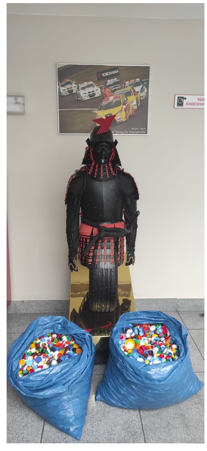
Russian environmental charity project (collection of plastic bottle caps)

YRPZ employees collected 30 kg of plastic caps in 2021. The money was then sent to buy a wheelchair for a boy with cerebral palsy.