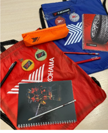
School goods for school-aged children of employees