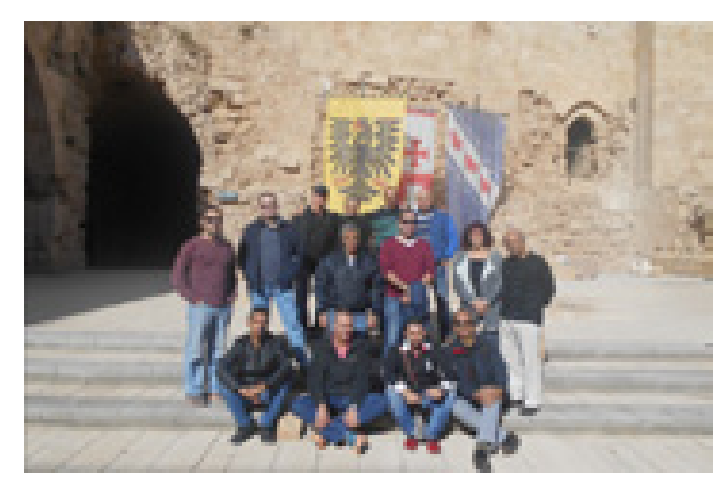
A scene from the company trip for employees