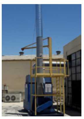
The exhaust pipe for the mixer has been improved.