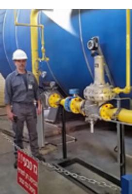
Carrying out maintenance on equipment that makes use of natural gas.