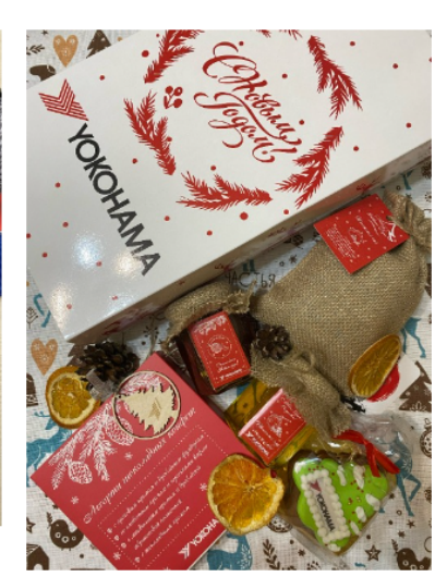
New Year's gifts for YRPZ employees