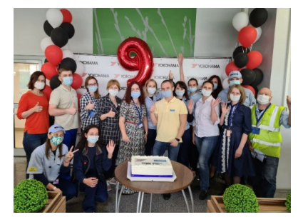
Celebrating the 9th anniversary of YRPZ

On May 30, 2021, YRPZ celebrated its 9th anniversary since its opening in 2012. On this occasion, a special dinner was organized for all employees and a special festive menu was prepared to show appreciation for the contributions of the employees. In December 2021, instead of the traditional offline New Year's party, a number of NY