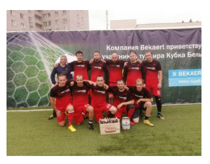
YRPZ Soccer Team Participates in Bekaert Soccer Cup

The YRPZ soccer team continues to attract and excite fans and spectators with outstanding performances. In 2021, the team participated in the regional soccer league as well as in the Bekaert Soccer Cup Tournament on the occasion of Belgium Day, finishing in second place. The YRPZ soccer team also participated in regional and federal tournaments throughout the year 2021.