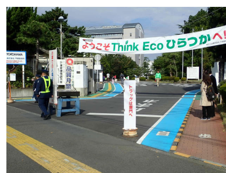
A view of the main gate where 3,000 people passed through