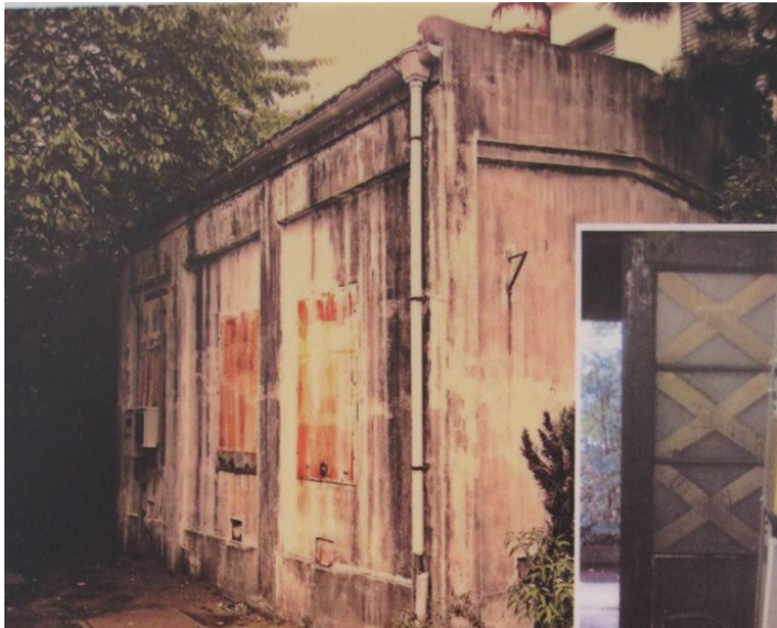
old telephone switchboard

It is a reinforced concrete building that is said to have been constructed around the early Showa period. It is confirmed in the photograph at the end of the war that there was a balcony on the second floor when it was used by the Navy, but it has been demolished now. The entrance is a double structure with iron doors, and the building number (25) written at the time of the Occupation Forces seizure remains on the lower right of the door.