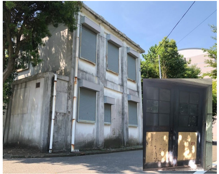
Old Navy Office Building

This is the remains of a platform and a track used from the time of the Naval Gunpowder Arsenal to the 1960s. At that time, marine and rail transport was the mainstream, so a dedicated track extended from this site to the lower reaches of the Sagami River, connecting with the marine transport route.