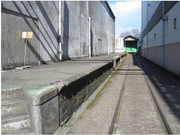
Old Pulling Line&Platform

This is the remains of a platform and a track used from the time of the Naval Gunpowder Arsenal to the 1960s. At that time, marine and rail transport was the mainstream, so a dedicated track extended from this site to the lower reaches of the Sagami River, connecting with the marine transport route.