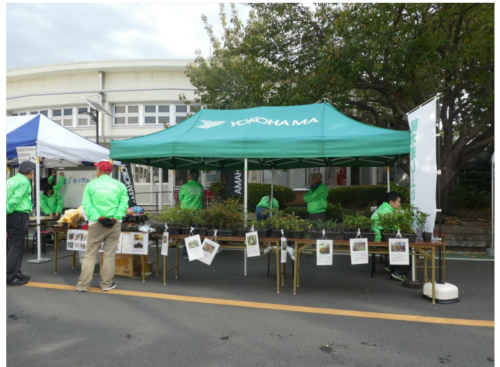
Provision of saplings grown by employees