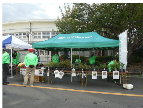
Free distribution of home-grown saplings grown at business sites

Panels related to this site are displayed next to the main and east gates of our Hiratsuka Factory. If you live in the Hiratsuka area, you can see them when you stop by. Last year, we exhibited an environmental booth as shown in the photo below and welcomed everyone.