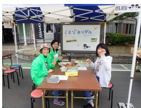
Activities of the Wild Bird Watching Club