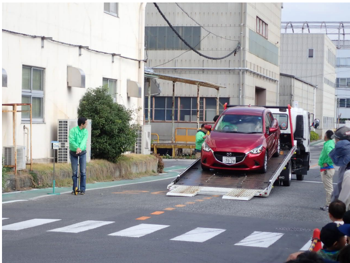
Rolling test of eco-friendly tires