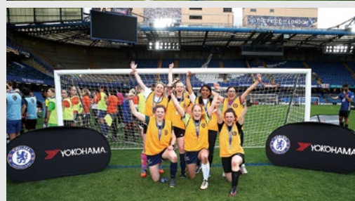
Football tournament at Stamford Bridge joined by key workers from NHS trusts